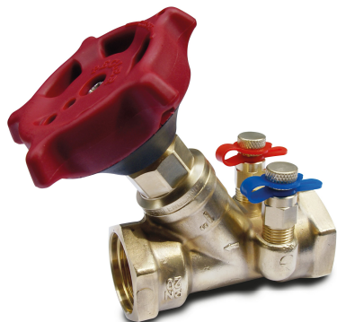
1260 Fixed commissioning valve

DZR Fixed orifice commissioning valve (FODRV). ISO 228 parallel thread, with regulation, isolation and flow measurement functions