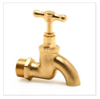
this article is part of a product group (701S) that contains a total of 2 items